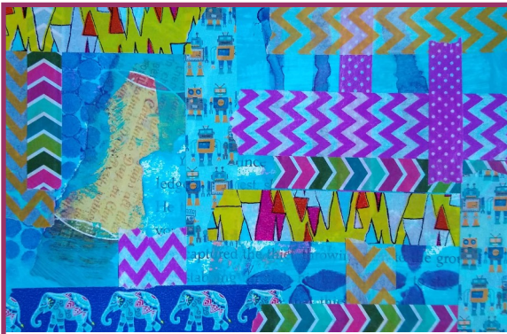
A collaged postcard by Amanda.

It's easy to make and decorate your own postcards with materials you already have around the house. Sending a postcard is a quick and easy way to show your friends you care—and a postcard stamp only costs 35¢!